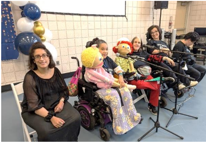
CPW's Vocal Groove Music Ensemble