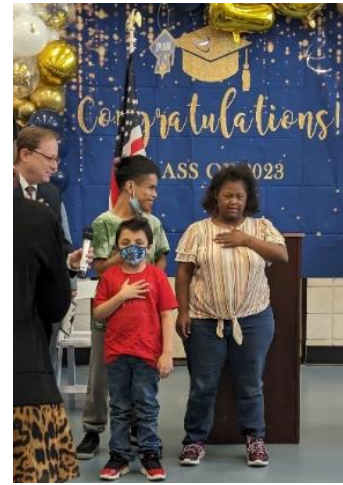
Scouts leading the Pledge